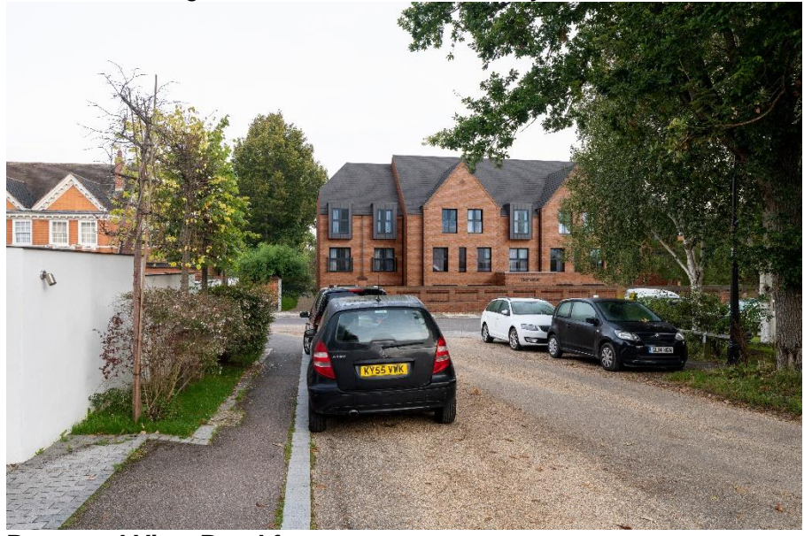
Proposed View Road frontage

located on a raised street level along View Road where the proposed building will positively complement its varied context while retaining a number of established features of this part of the conservation area such as the enclosed nature of the View Road building, the suburban, residential, verdant character of View Road as well as featuring the established architectural forms and materials reinterpreted in a more contemporary key. The building fronting View Road is supported from the conservation perspective with encouragement to further refine the façade treatment, dormers, and porch.