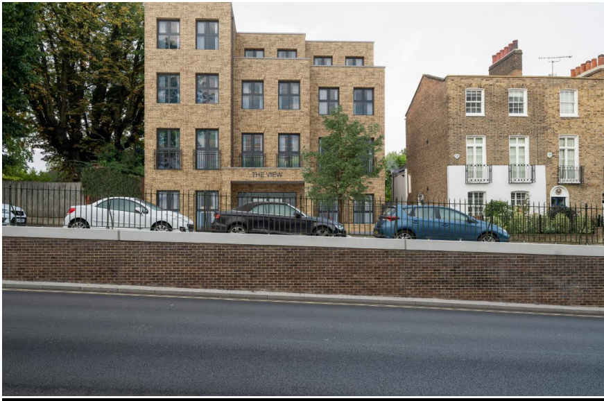
Proposed North Hill Frontage

6.3.13 The Conservation Officer notes that the proposed office building along North Hill retains the proportions of the existing one, which is bland and monolithic and offers a straightforward opportunity for improvement. The proposed design seizes this opportunity to enhance forms, functions, and setting of the listed terrace and introduces an interesting articulation of heights and masses and a facade design inspired by the adjacent Georgian terrace and softened by the elegantly multifaceted brickwork façade. The proposal has been carefully shaped and assessed in views across the conservation area along North Hill and by virtue of its sensitive design approach, it fully respects the architectural primacy and legibility of the listed terrace in its urban context and is supported from conservation grounds.