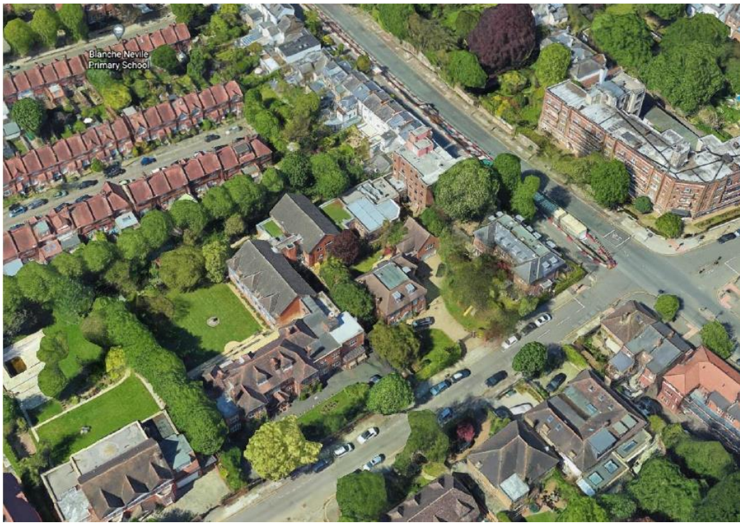
Fig 1 – Aerial View